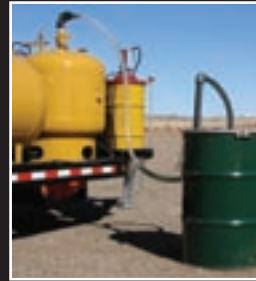
Vacuum fresh gear oil in the system