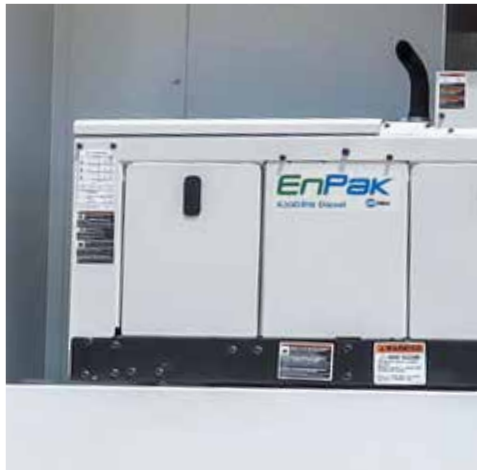
Miller EnPak® A30 compressor