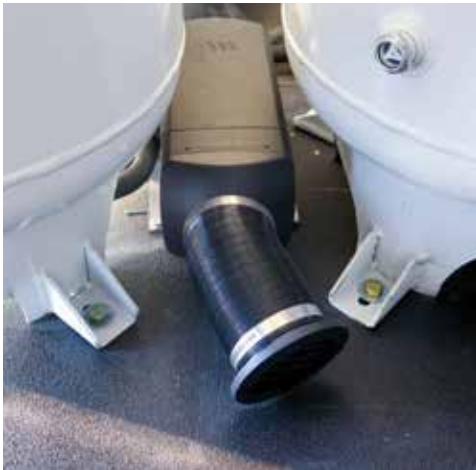
Enclosed truck body heating system