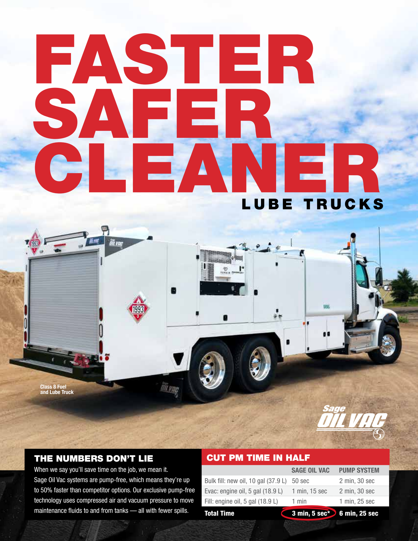
Class 8 Fuel and Lube Truck