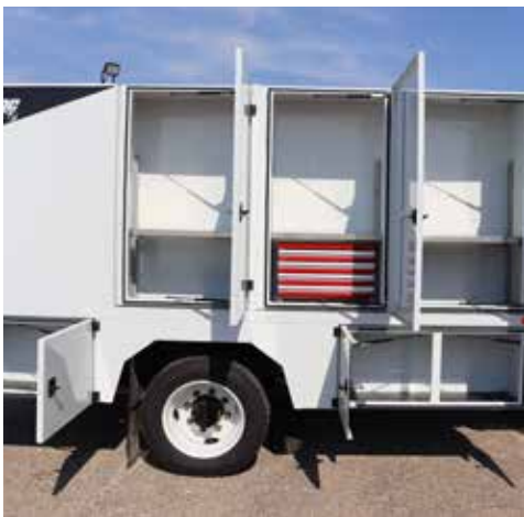
Plenty of storage space and mechanics drawer