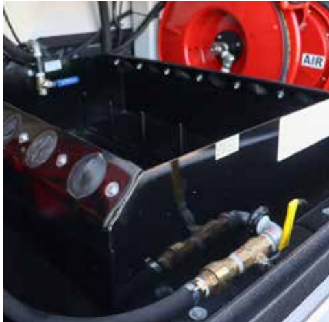
Patented Used Filter Receptacle™