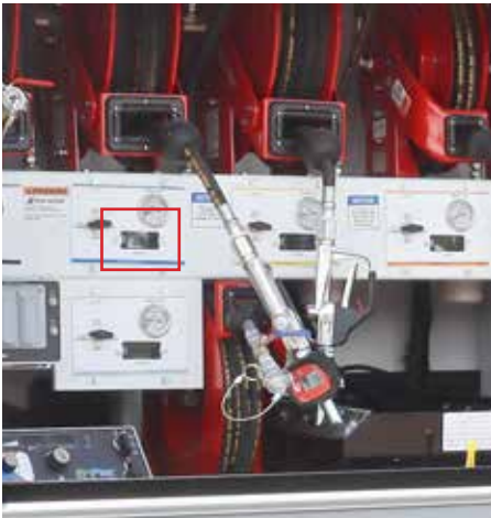
Fluid level display