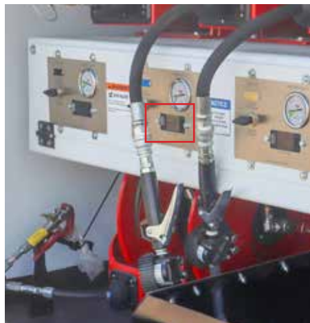
Fluid level display